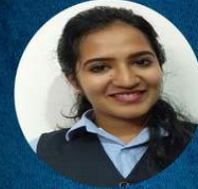
Sweetie K M